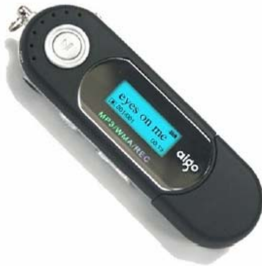
Stick Mp3 Player.