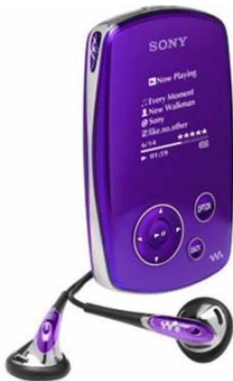
Sony NWA1000V 6 GB HDD Walkman

iTunes comes with the shuffle or you can download it from www.apple.com while you're waiting for it to arrive and start ripping your cds.