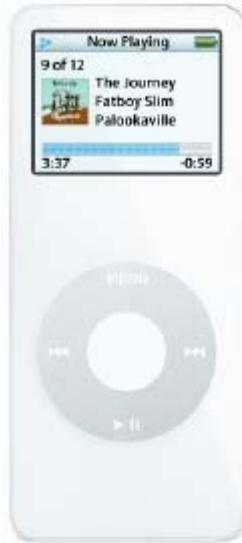
Apple 2 GB iPod Nano White or Black

Visit now www.Emiule.com your source of information on digital music Emiule.com