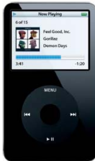
Apple iPod - 30GB – Black or White [with video playback]

Here is a list of some of the best MP3 players available.