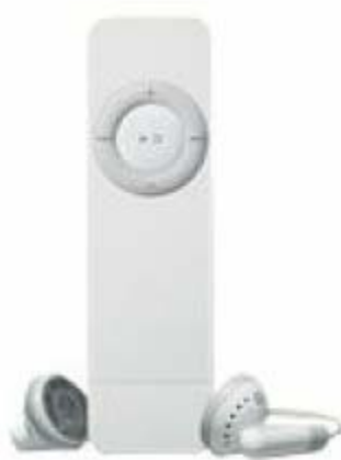
Apple iPod shuffle - 512MB

Visit now www.Emiule.com your source of information on digital music Emiule.com